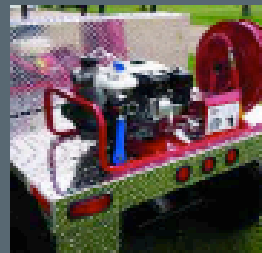
FireCaddy® Truck Mount