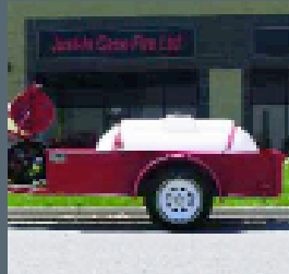
FireCaddy® Trail 1250